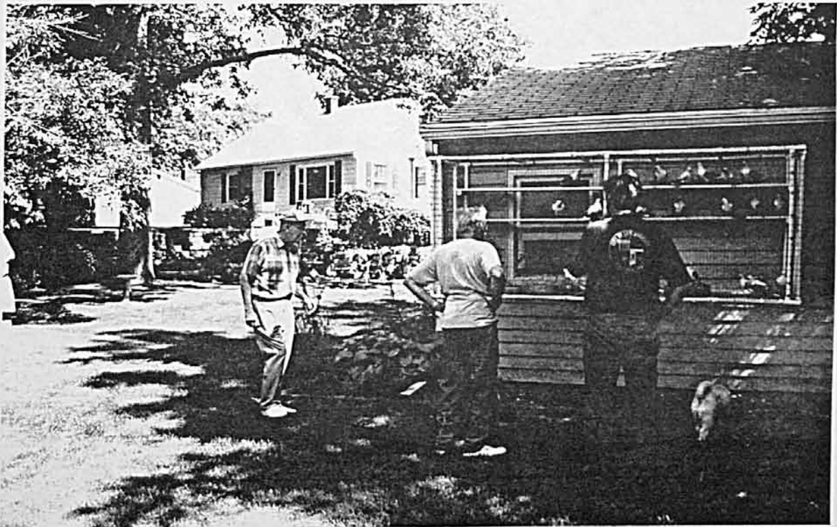
In Cal's backyard, looking at reds and yellows.